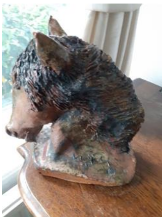
Agnes Maxwell (left) Ceramic

Share Your Creations! Please send photos of your art with title/medium to gallery@caterhamartgroup.org.uk