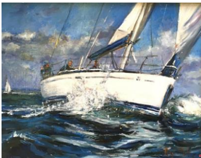
Around the Island Race Oil on panel