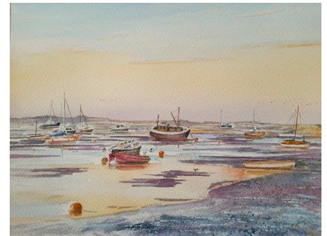
Boats at Low Tide (right) Brancaster, Norfolk By Nevil Hagon Watercolour