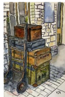
Station Suitcases 2023 Watercolour Tracey Bengueyfield class

Recently, I have started going to watercolour classes with Tracey Bengueyfield, and now I enjoy watercolour far more than I ever did previously. It really is all good fun!