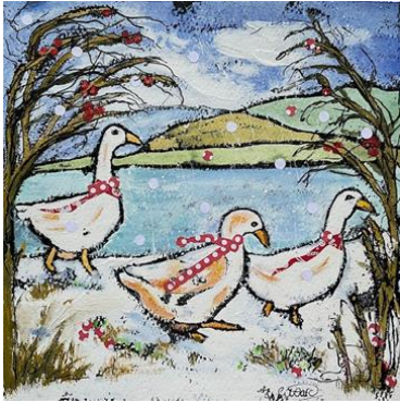
Christmas Card 2024 (left) By Wendy Ward Ink resist and collage